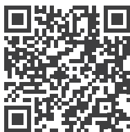
Apple App Store